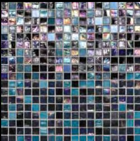
LAS VEGAS CL69**