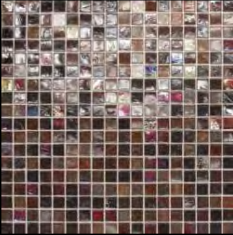
MONTE CARLO CL63**