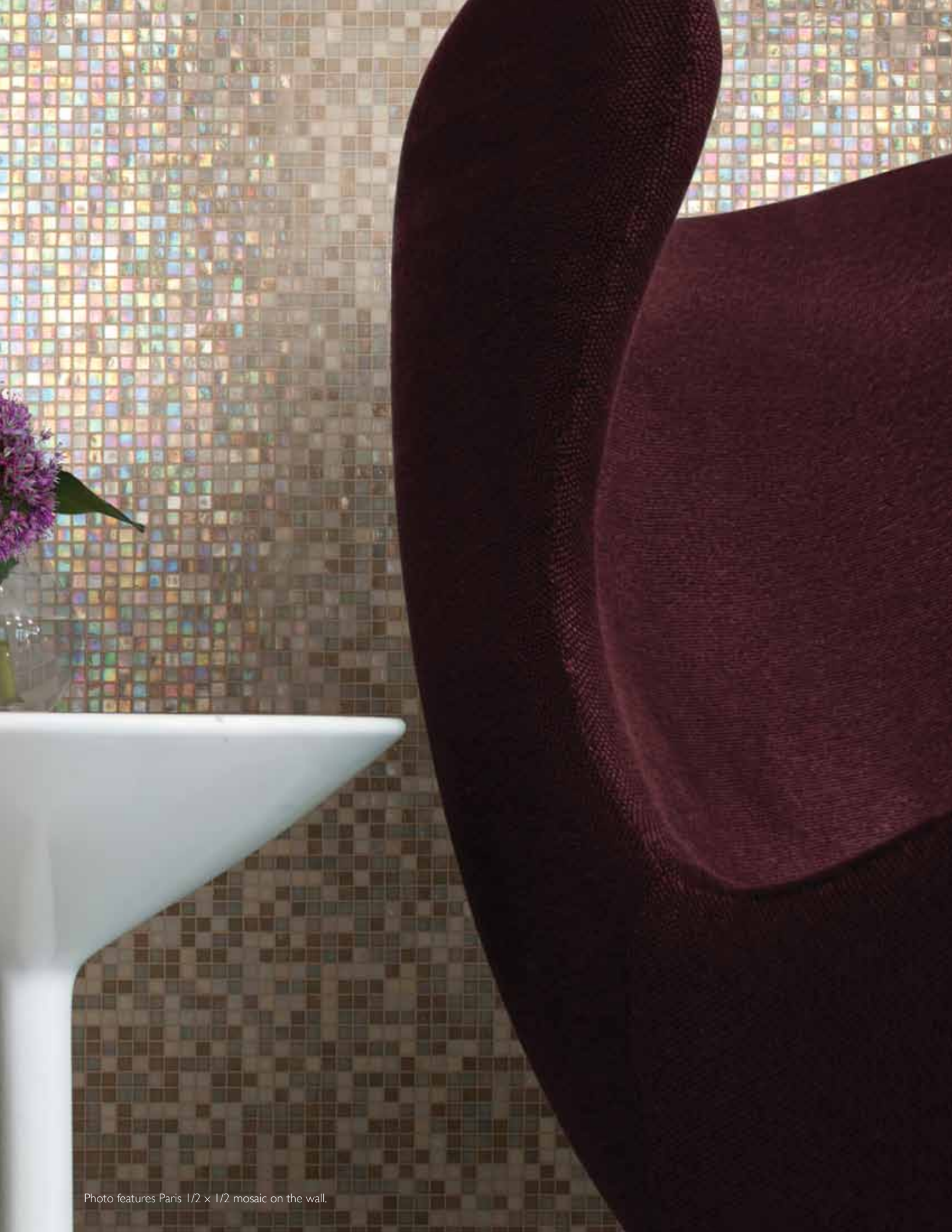
Photo features Paris 1/2 x 1/2 mosaic on the wall.