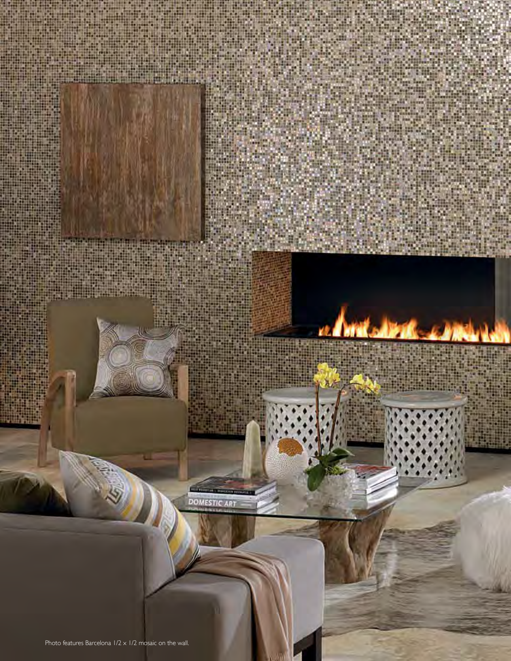
Photo features Barcelona 1/2 x 1/2 mosaic on the wall.