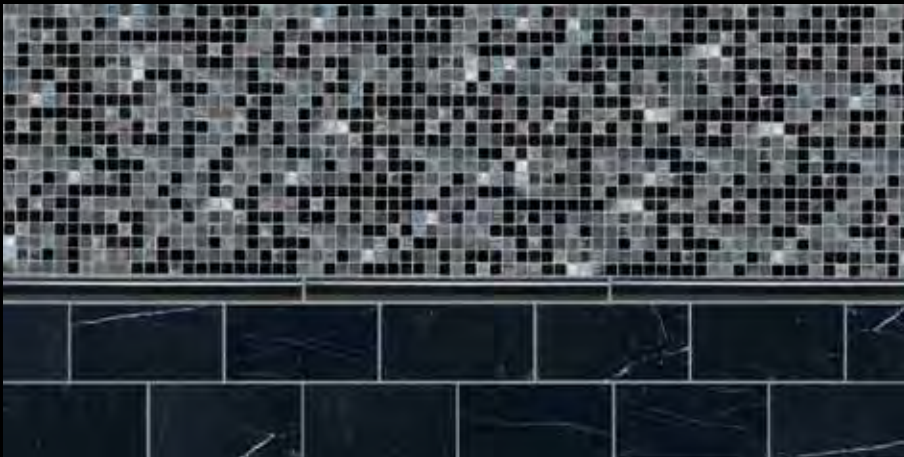
Backsplash features Manhattan 1/2 x 1/2 mosaic with Marble Nouveau Nero 3 x 6 field tile and 1 x 12 pencil rail.