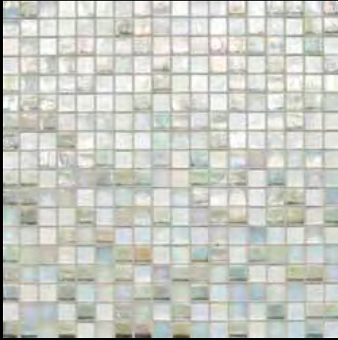
ST. MORITZ CL65*