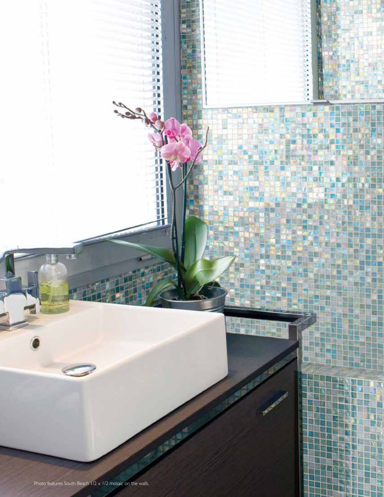
Photo features South Beach 1/2 x 1/2 mosaic on the walls.