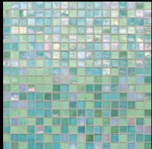
ST. THOMAS CL70**