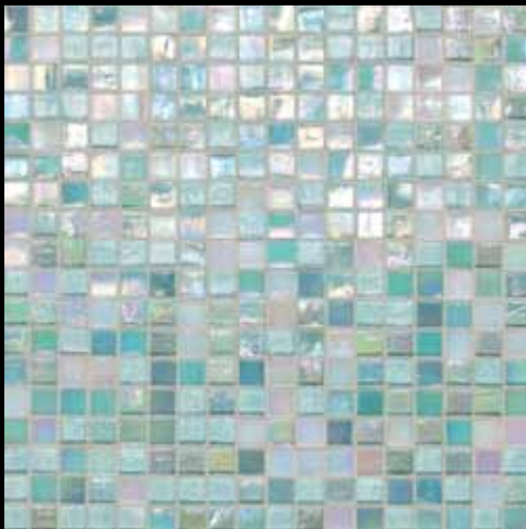
SOUTH BEACH CL71*